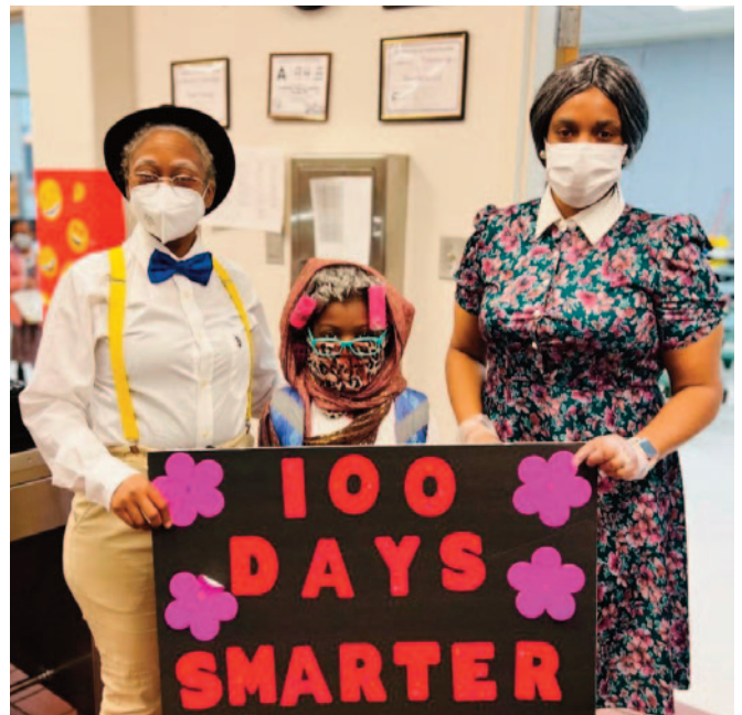
100th Day of School at Wintergreen Primary School