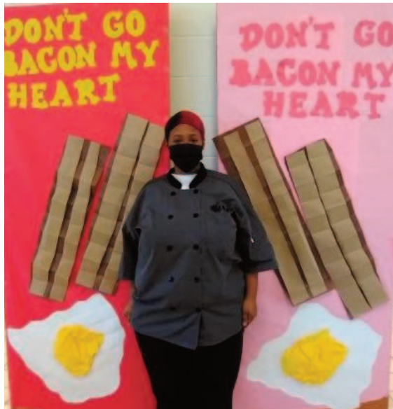
Lakeforest Elementary School artwork