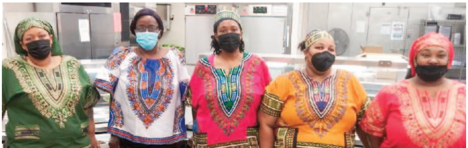
Creekside Elementary School celebrates Black History Month